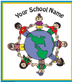
Design # 1