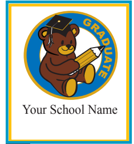
Design # 7