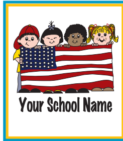
Design # 4